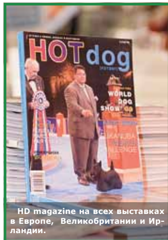
HD magazine на всех выставках в Европе, Великобритании и Ирландии.

1 year subscription including mail delivery 50 Euros only!