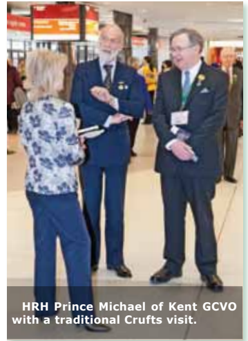
HRH Prince Michael of Kent GCVO with a traditional Crufts visit.