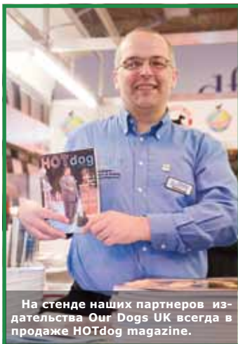
На стенде наших партнеров - издательства Our Dogs UK всегда в продаже HOTdog magazine.

Since a few years the finals take place in the Arena where demonstrations and competitions are held the whole day long. If you want, you can stay there from morning till evening and not getting bored.