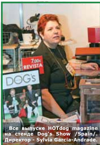
Все выпуски HOTdog magazine на стенде Dog's Show /Spain/. Директор - Sylvia Garcia-Andrade.